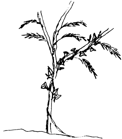
Figure 3. Bindweed growing on upright plant.

soil. Most of these lateral roots are no deeper than 1 foot. Experiments on bindweed have shown that its root and rhizome growth can reach 2.5 to 5 tons per acre.