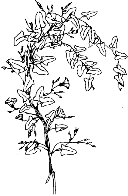
Figure 1. Field bindweed.

Integrated Pest Management for Home Gardeners and Professional Horticulturalists