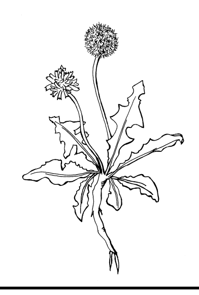
Figure 1. Dandelion.

Integrated Pest Management for Home Gardeners and Professional Horticulturalists