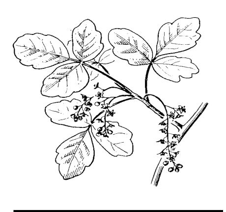
Figure 1. Poison oak in bloom.

Contact with poison oak leaves or stems at any time of the year can cause an allergic response. When the allergen contacts the skin surface in sensitive individuals, it is rapidly absorbed into the surrounding cells. Within 1 to 6 days, skin irritation and itching will be followed by water blisters, which can exude serum. Contrary to popular belief, the exuded serum does not contain the allergen and does not transmit the rash to other regions of the body or to other individuals. The dermatitis rarely lasts more than 10 days.