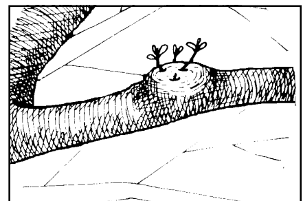
Figure 3. Mistletoe resprouts after being cut back.

The most drastic and possibly the best control measure is to remove severely infested trees and replace them with less susceptible species. Economically,