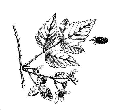
Figure 4. California blackberry.

1 inch across with five white or pink petals. The fruits are black and tasty when ripe. New canes are produced each year from the crown (base of the plant), replacing those that die naturally. New plants start from crown regrowth, rhizomes, and seeds that