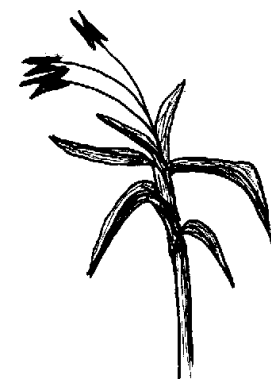
Figure 4. Kikuyugrass anthers protruding from stem.

Mulching with strong landscape fabric can be effective if it is overlapped and