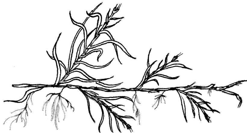
Figure 1. Kikuyugrass stolon showing rooting at nodes.

Integrated Pest Management for Home Gardeners and Professional Horticulturalists